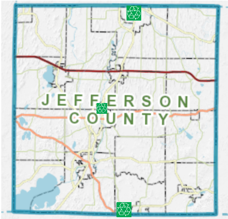
Jefferson County Fair Park 503 N. Jackson Avenue, Jefferson